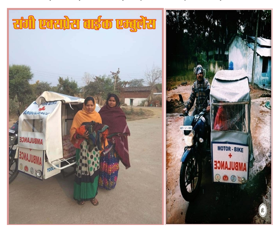
Fig.2 Motor bike Ambulance /SangiExpress

Five Motor bike ambulances specially engineered, pictured in Fig 2, specifically engineered for to act as a means of commutation in difficult to reach areas. The designing of motor bike ambulance / SangiExpress, includes comfortable sitting arrangement for minimum of five to six people to accommodate along with essential first aid tools and equipment. Similar motor bike ambulance services have been initiated in Sierra Leone and have shown positive response on its acceptability and accessibility in rural setup.